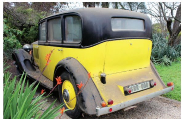
above top: A colour picture found on the Internet of the car.